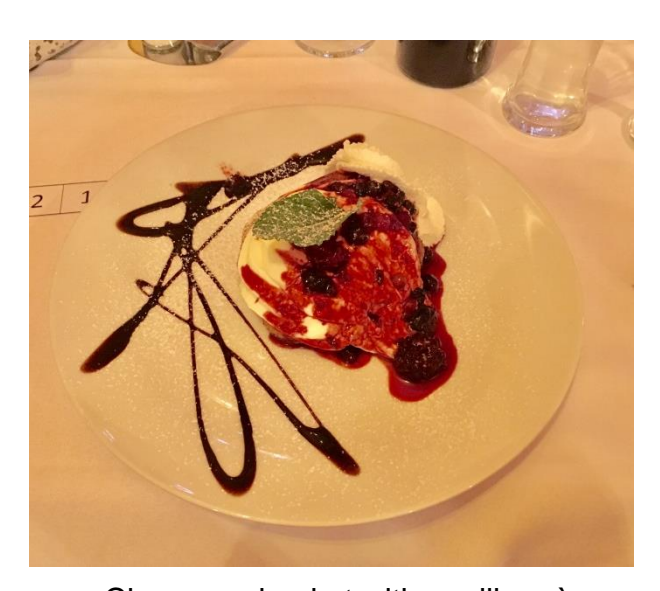
Cinnamon basket with vanilla crème

On Tuesday evening we had the welcome dinner with representatives of the University of Žilina. We had an exciting bus ride to the restaurant Panorama Kolibar. The streets were very slim and the reversing possibilities for the bus were limited, and after some time we recognized that we were on the wrong way. After a complicated reversing maneuver of the bus driver, a short continuation of the bus ride and a short walking, we finally arrived at the restaurant. The restaurant was a typical Slovak restaurant with classical Slovak dishes like potato dumplings filled with sheep cheese, duck breast with raspberry risotto, apple-poppy strudel and vanilla sauce or cinnamon basket with vanilla crème. Typical Slovak white and red wines were served for drinking. We had a cosy and amusing evening and came back to the hotel very satisfied.