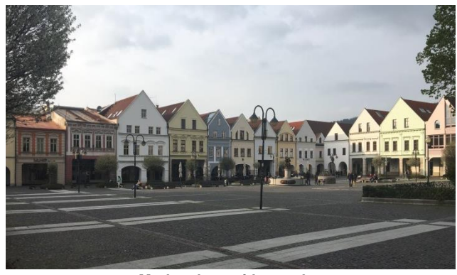
Marketplace with arcades

An example is the quadratic medieval marketplace with around 100 arcades and 45 burgher houses. The old city hall and the Jesuit's church with a monastery are situated there. Underneath it the historical catacombs of Žilina, which we visited right at the beginning of our stay, are located.