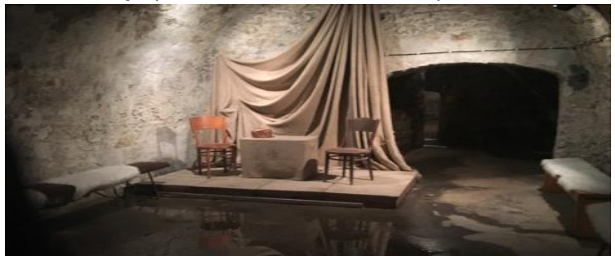
Catacomb beneath the Jesuit's church

After two exciting days in Bratislava we went to a smaller city called Žilina.